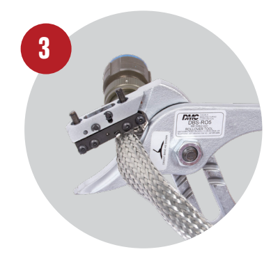
Use the rollover tool to roll over the cutoff tab.