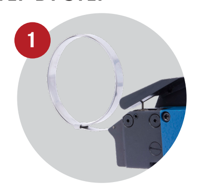
Insert the band loop-side up. Squeeze the blue tensioning handle until the tool locks.