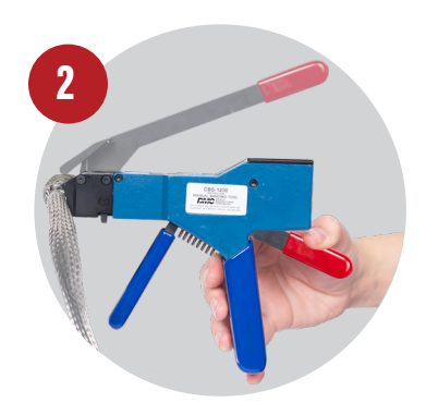
Lift the red cutter lever up to secure the band and back down to terminate the band.